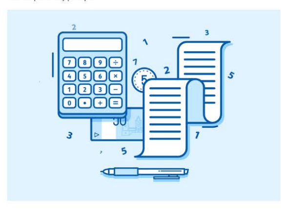
South San Francisco, CA What's Accounting Gotta Do With It?