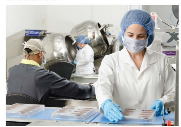
The Road to Market - From IND Preparation to NDA Approval